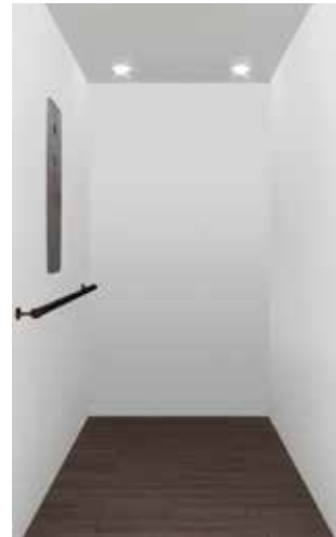
Melamine Panel (Optional)