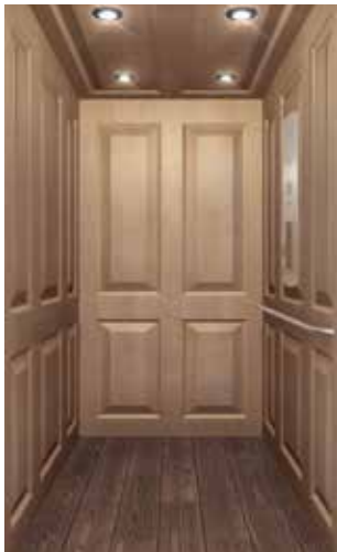
Raised Panel* (Upgrade)