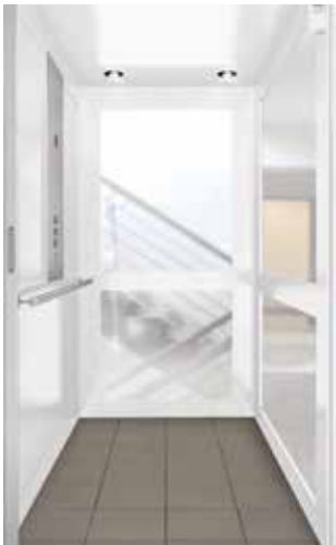
Aluminum and Glass Panel (Upgrade)