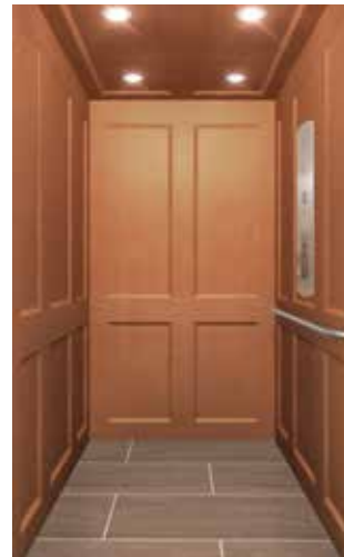
Recessed Panel* (Upgrade)