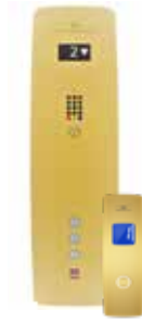
Polished (Mirror) Gold