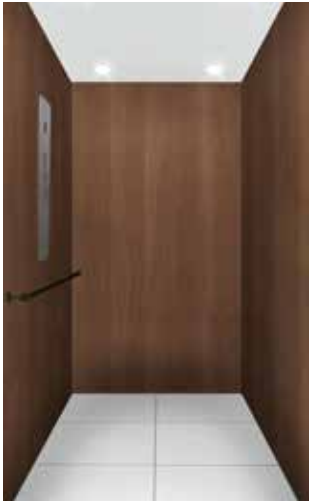
Veneer Panel (Standard)