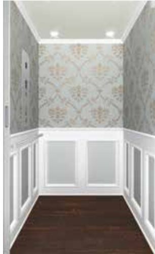
Design It Yourself / MDF Walls (Optional)